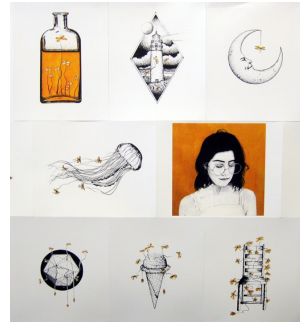
2018 Overall Winner: The Flower Series

https://www.stlcc.edu/campus-life-community/cultural-arts/art-galleries/wildwood-art.aspx