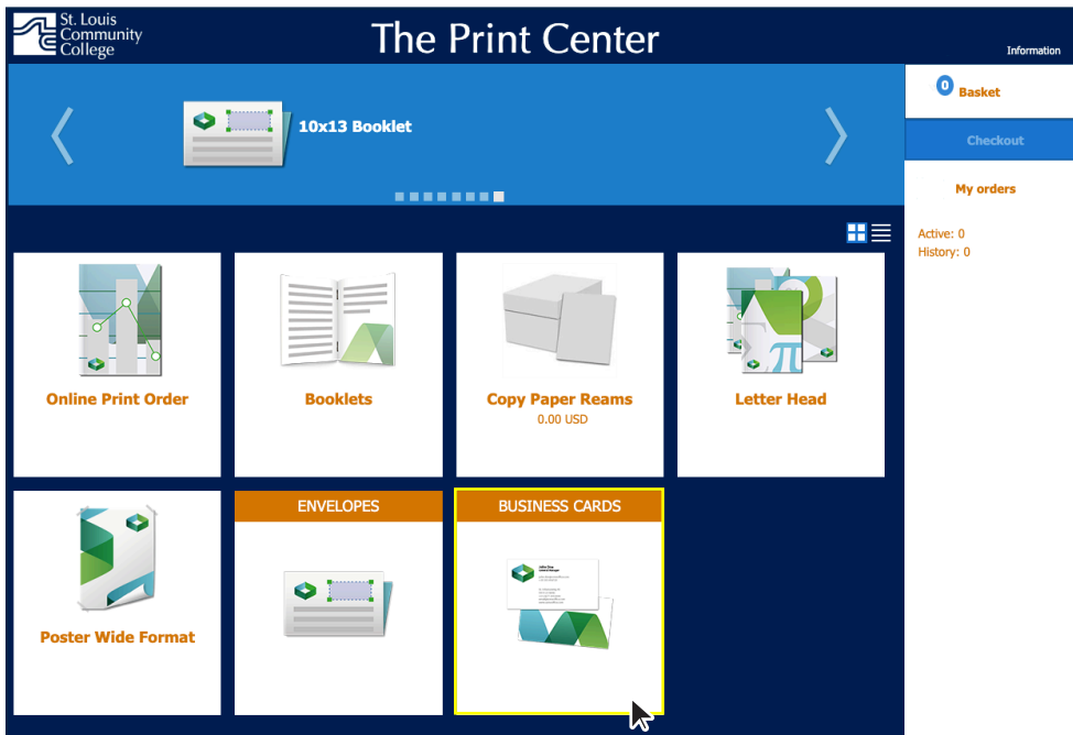
SumnerOne/STLCC Print Center Portal Landing Page

The SumnerOne/STLCC Print Center link is also located on the faculty and staff webpage: stlcc.edu/portal-pages/faculty-and-staff